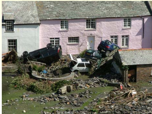
Boscastle floods, 2004